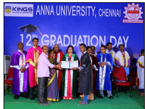
Graduants receiving degree certificate from their parents

A group photo session was also arranged by the respective departments with all the graduates.