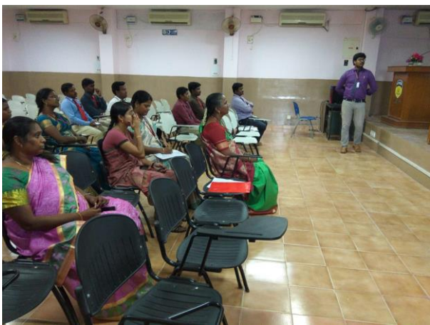
Resource Person's Talk