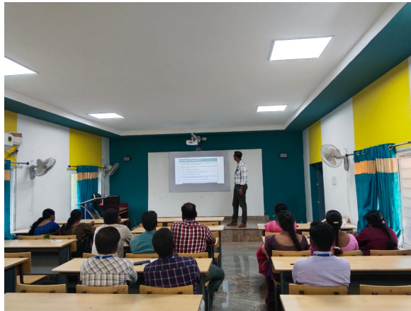
Resource Person's Talk