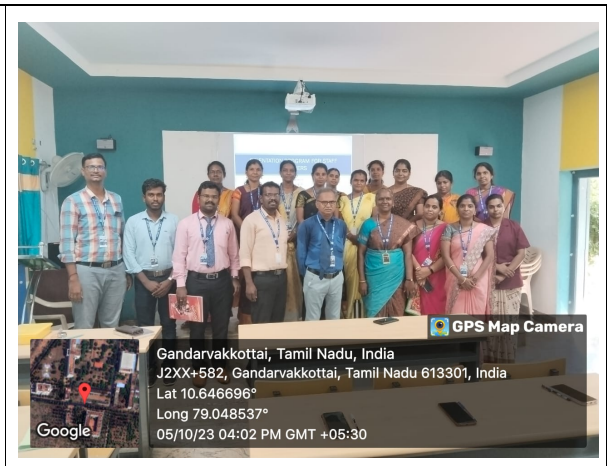
Resource Person along with Participants