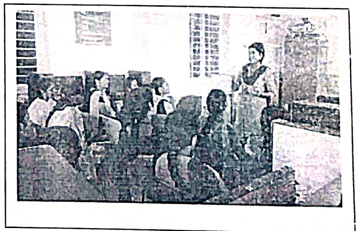
View of II Year students listening to Alumnus

No.: of students attended the session : 43